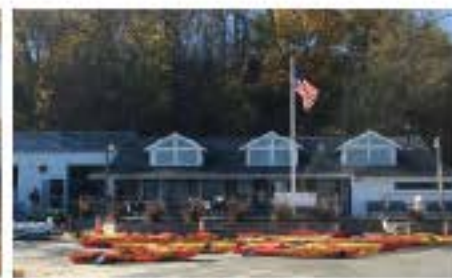
5 North Shore Yacht Club 21 Park Ave.