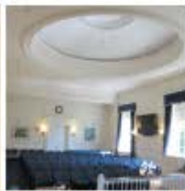
10 City of Highland Park City Hall 1707 St. Johns Ave.