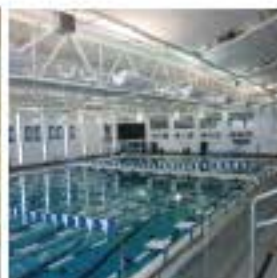
3 Highland Park High School (SD113) 433 Vine Ave.