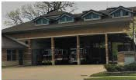
6 City of Highland Park Fire Department Station 33 1130 Central Ave.