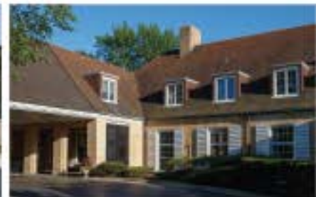
12 Northmoor Country Club 820 Edgewood Rd.