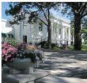
1 Exmoor Country Club 700 Vine Ave.