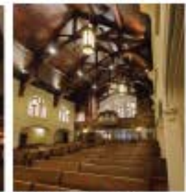
9 Highland Park Presbyterian Church 330 Laurel Ave.