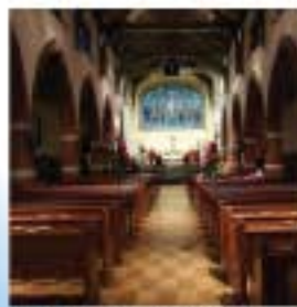
8 Trinity Episcopal Church 425 Laurel Ave.