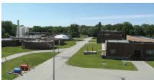
14 Water Reclamation Plant 1210 Clavey Rd.