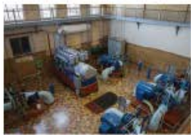
4 City of Highland Park Water Treatment Plant Park Avenue Beach