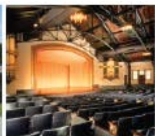
15 Ravinia Festival Advance registration only