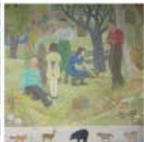
2 Green Bay School (SD112) 1936 Green Bay Rd.