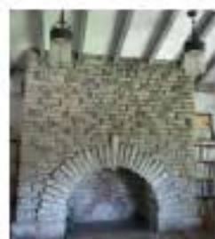
16 Braeside School (SD112) 150 Pierce Rd.