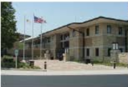
11 City of Highland Park Police Station 1677 Old Deerfield Rd.