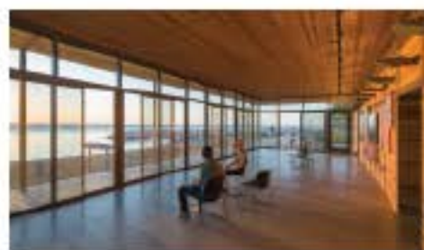
13 Rosewood Beach Interpretive Center 883 Sheridan Rd.