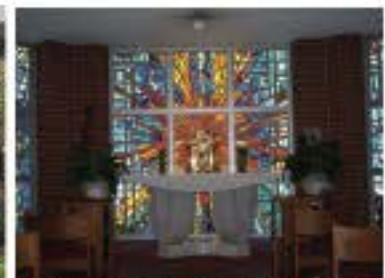
7 Immaculate Conception Parish 770 Deerfield Rd.